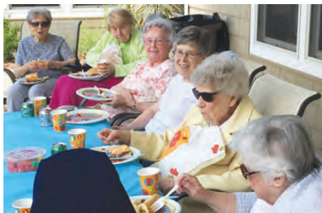
Picnic in New Windsor.

Official permission to become one was requested from Rome in 1997, and was followed by the first general chapter! Now one, the community became known as the Presentation Sisters of New Windsor, New York.