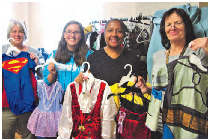
Some of the wonderful volunteers from the Newburgh Ministry who assist in operating the Thrift Store along with the Presentation Sisters.