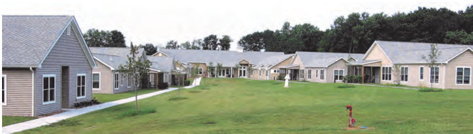
Mount Saint Joseph in New Windsor, NY. The Presentation Sisters moved to this property in 2009.

We’re grateful that you’ve joined us in placing ourselves in the path of those who need assistance, especially the poor and the oppressed.