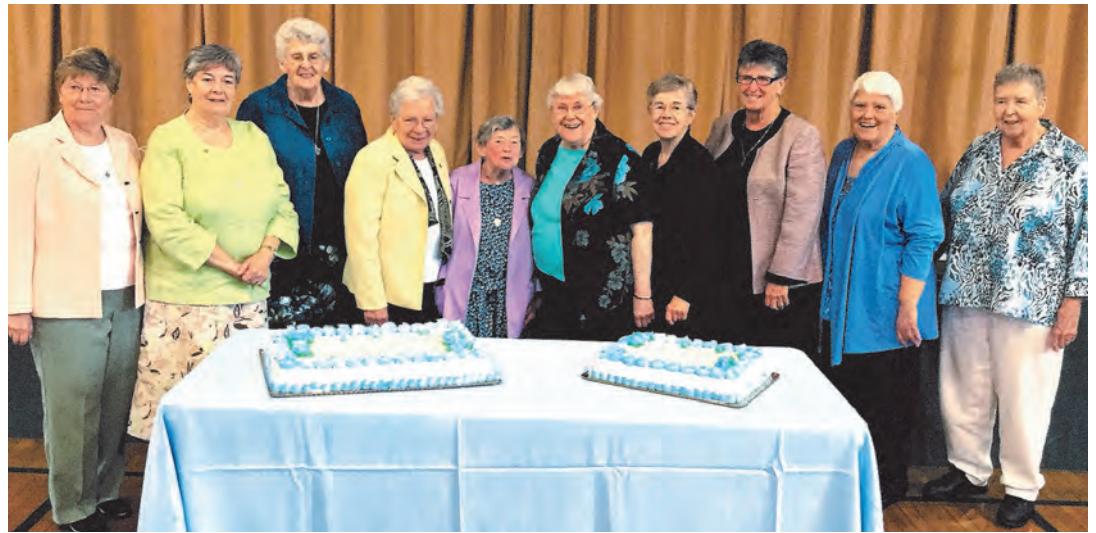
On Saturday September 8 th , there were over 125 Sisters, Associates, friends and family members who attended the Jubilee celebration to honor our 10 Jubilarians as they celebrated their anniversaries as Presentation Sisters. This celebration took place at St. Thomas of Canterbury in Cornwall on the Hudson, NY starting with 11 Am Mass honoring the Jubilarians and followed by lunch in the parish hall. The afternoon was enjoyed by all while reminiscing and visiting friends and relatives.