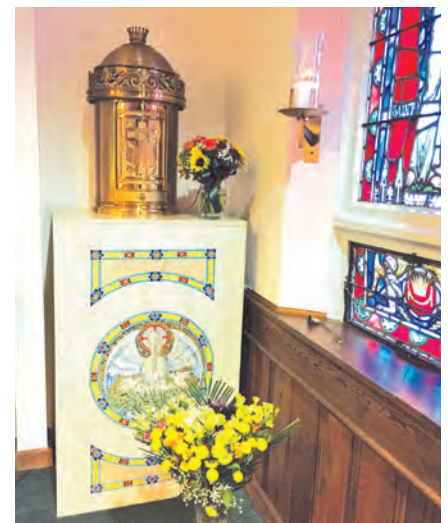
Chapel at Presentation Convent, Leominster, MA

You can support the Sisters of the Presentation now or in perpetuity by including them in your will. We know your family's needs come first, but once those are set, you can make sure your legacy lives on in works of charity by making a bequest to us. The donation can benefit specific ministries of the Sisters, or you can direct us to use it to support the congregation's greatest needs at various times. Please contact the Office of Mission Advancement for additional information at 845-567-0204.